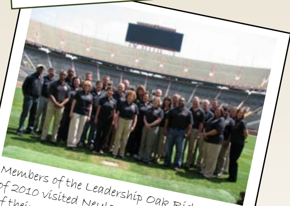
Members of the Leadership Oak Ridge Class of 2010 visited Neyland Stadium as a part of their retreat.