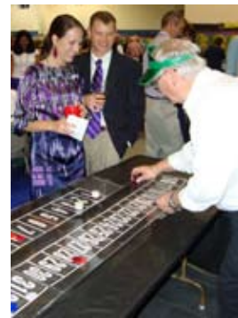
The good times were rolling at the casino-style tables during Methodist Medical Center's New Orleans-themed Casino Night event held Saturday, April 17. Guests enjoyed riverboat "gambling," a Creole buffet and Dixieland jazz.

The Methodist Medical Center Foundation hosted Casino Night 2010, Rollin' on the Bayou, on Saturday, April 17. The annual fundraiser offered guests a night in New Orleans with Creole cuisine, riverboat "gambling," and a jambalaya of entertainment including live performances, Dixieland jazz and live and silent auctions. The evening ended with