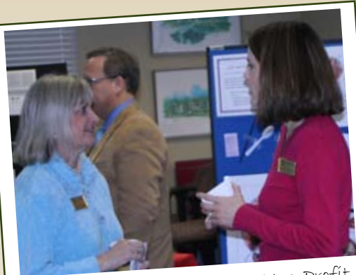
The Chamber's First Quarter Non-Profit Business & Breakfast included the Red Cross, March of Dimes, IAAP Oak Ridge Chapter and and Contact Helpline.