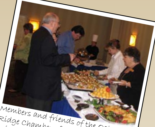
Members and friends of the Oak Ridge Chamber of Commerce enjoy a delicious buffet at the March Business After Hours at the DoubleTree Hotel.