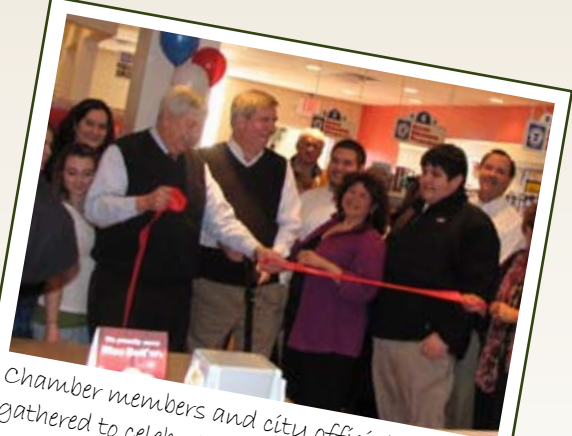
Chamber members and city officials gathered to celebrate a ribbon cutting ceremony at Munsey Pharmacy.