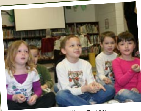
Members of the Willow Brook Elementary School Transition class entertained Chamber members at the CH2M Hill Business & Breakfast.