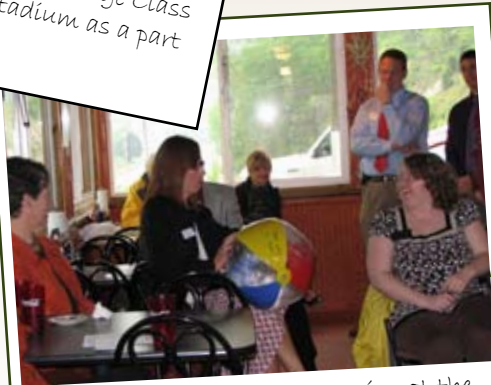
Members compete for a door prize at the Riverside Grill's Business After Hours in April.