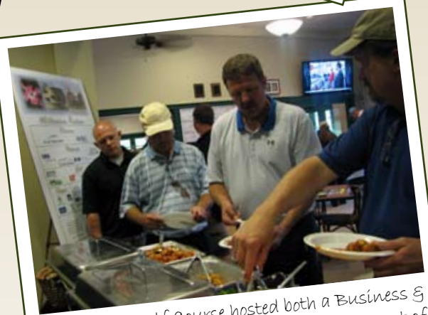
Centennial Golf Course hosted both a Business & Breakfast and a Business After Hours as part of the Golf Tournament.