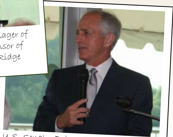
U.S. Senator Bob Corker addresses the audience.