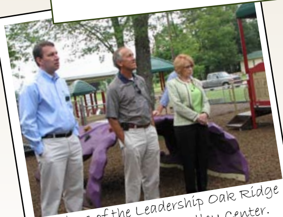
Members of the Leadership Oak Ridge Class tour the Emory Valley Center.