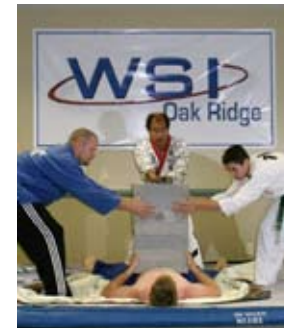
EUN and TTJC students perform a martial arts demonstration

NetGain Corporation was recently named a Free Enterprise Honoree by the US Chamber as part of the 2010 DREAM Big Small Business of the Year Award campaign. This national distinction honored small businesses for their strong business practices and significant contributions as drivers of economic growth. www.netgain-corp.com