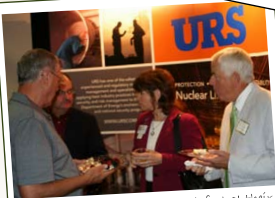
URS hosted a Business & Breakfast at their newly renovated offices on Mitchell Road.