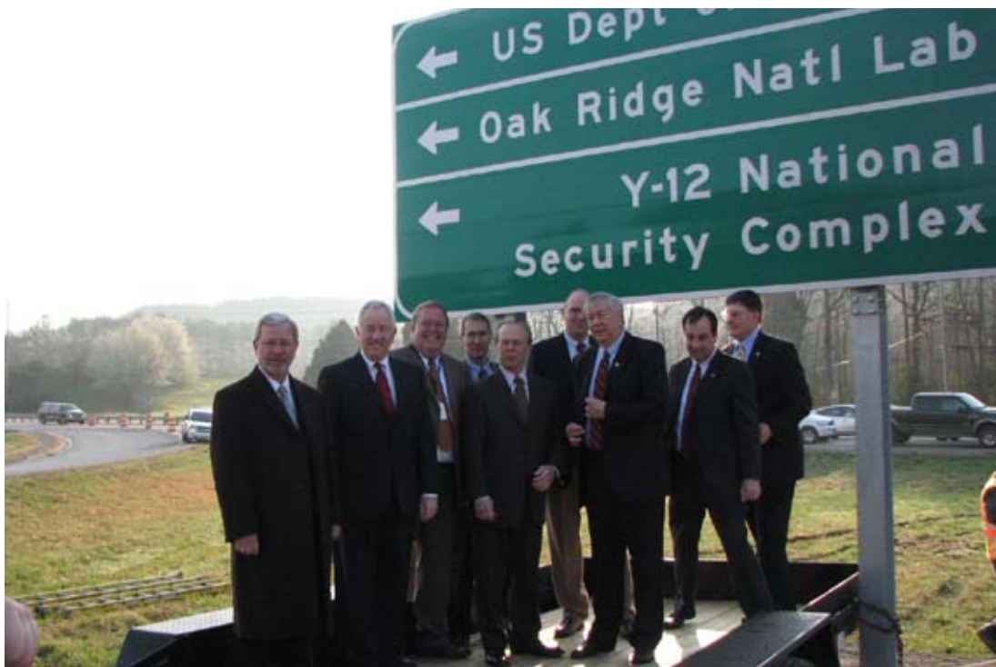
Tennessee Commissioner of Transportation Gerald Nicely was joined by area officials to unveil one of the new interstate directional signs. The signs were recently erected to help direct visitors to the US Department of Energy, Oak Ridge National Lab and the Y-12 National Security Complex.