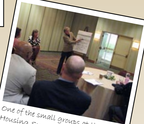
One of the small groups at the Housing Summit work on ideas for the future of housing in Oak Ridge.