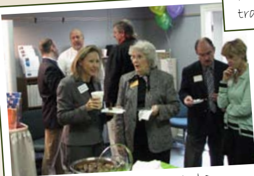
Advanced Management hosted a Business After Hours event at their office in March.