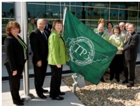
The Y-12 National Security Complex and the National Nuclear Security Administration's Y-12 Site Office celebrate receiving the Tennessee Pollution Prevention Partnership (TP3) green flag.