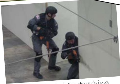
Wackenhut hosted a networking coffee at its Central Training Facility and demonstrated a training drill for their guests.