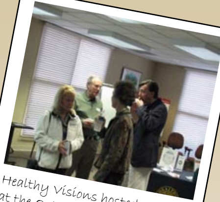
Healthy Visions hosted a coffee at the Oak Ridge Chamber in March.