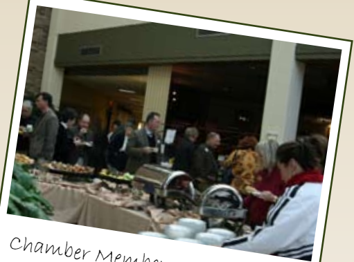
Chamber Members gathered at the Doubletree Hotel for a networking coffee in April.*