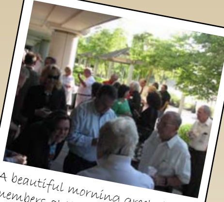
A beautiful morning greeted members at the Chambers Breakfast and Business in June.