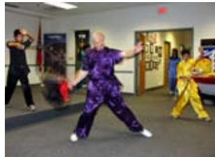
Members of the Wushu Team participate in a demonstration.

nuclear facilities at U.S. Department of Energy (DOE) and Defense (DoD) facilities. www.p2s.com