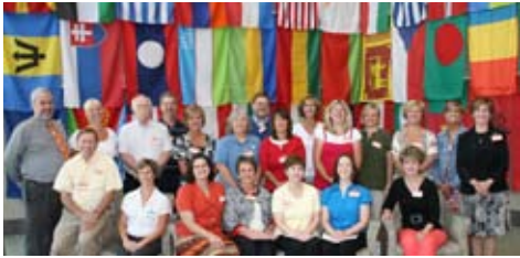
Educators on the tour of ORNL.

Partners in the regional economic development initiative, Innovation Valley Inc., organized an eight-week series, "Educators in the Workplace Lunch & Learn." During the summer, eight different companies located in the Innovation Valley hosted 67 educators and guidance counselors from Oak Ridge & Blount, Knox, Loudon & Roane counties for a lunch & learn series. Many participants attended multiple sessions.