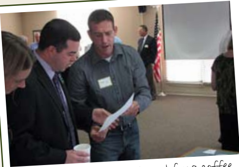
Chamber Members gathered for a coffee featuring some of our Non-profit members in August.