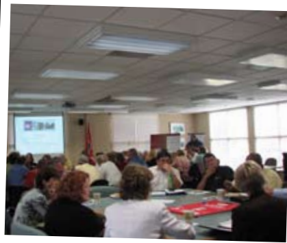
Participants at the Chamber's 1st Follow-up Meeting on Housing brainstorm together.