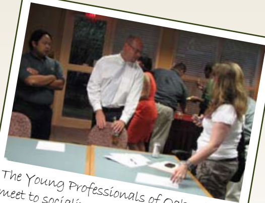
The Young Professionals of Oak Ridge meet to socialize and to work to make an impact on the city of Oak Ridge.